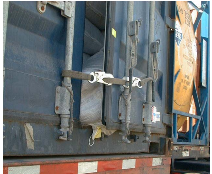
Container Inspectors also look for damage which might compromise its integrity at sea. The exterior of each container is examined for defects such as broken welds, bent/torn steel frames, broken floor supports.

The first lesson was safety. Working within a busy port facility can be dangerous and safety precautions must be adhered to. There are tractor-trailers, large fork-lifts and other handling equipment constantly moving about to pick up or drop off containers. As we inspected a container or group of containers, the CG vehicle was always positioned between the inspection team and the truck traffic lanes.