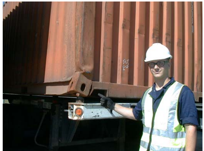
A bent frame and broken welds to the hardpoint earns this container a "hold" order:

The inside of a shipping container needs to be inspected; the actual contents are compared with the shipping manifest. One does not simply cut the customs seal on a container and open the doors. The door needed to have a special strap attached so if cargo was leaning against it, the door would not violently open when the rear latches were released, the door could burst open, injuring anyone standing behind it. In the picture to the upper right, you can see the potential for injury when a 100# sack of dried fish fell between a stacked to the roof load and the cargo door of a container being opened. The safety strap was in place, the doors held and no one was injured. Once opened, the interior of the container is allowed to air out for 15 minutes before the inspector enters.